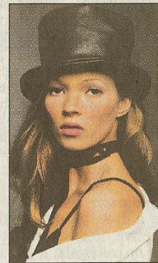
Kate Moss

Kate, who lost several lucrative contracts and checked into rehab after images of her snorting coke were printed is thinking about volunteering to improve her karma.